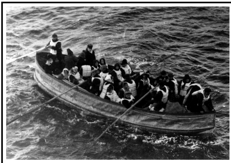
Survivors make their way to safety