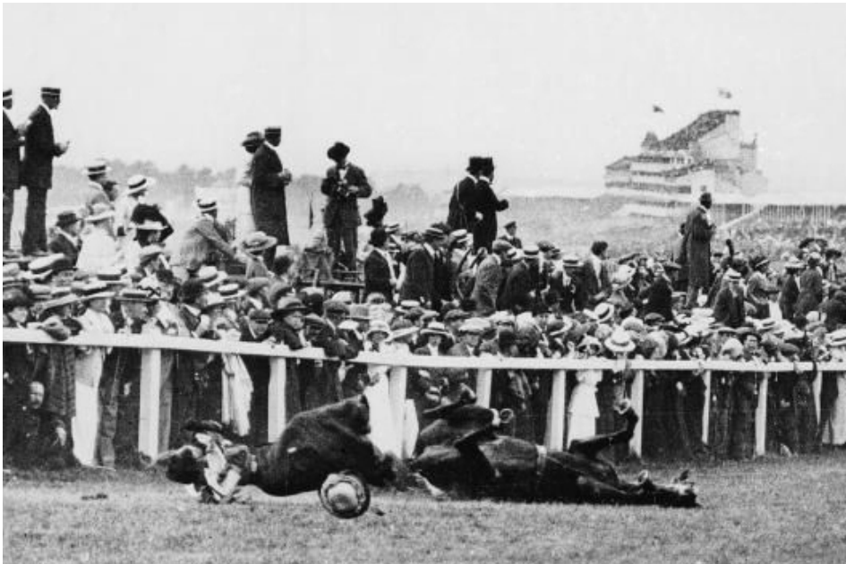
Miss Davison remains in a critical condition in hospital.

Whilst this may be true, many innocent people continue to suffer as the campaign for women's suffrage rages on and wreaks havoc in quiet pockets of this country.